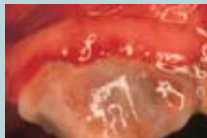
Periodontal disease with thick tartar formation and painful gums

The number one health problem diagnosed in cats and dogs over 4 years of age is periodontal disease. Dental disease puts stress on your pet's immune system and weakens the liver, kidneys and heart. We provide an extensive dental care program. Our clients have become aware of the importance of having their pets' teeth examined and cleaned on a regular basis. Preventive dental care can add years to the life of your pet.